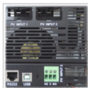
MAX 3X PV MPPT INPUT