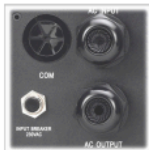
AC/DC CABLE GLAND*