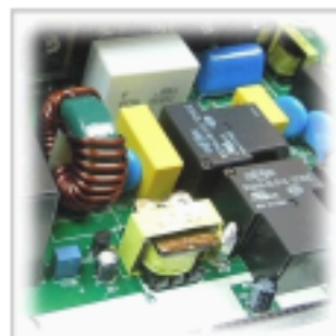
ENHANCED PCB COATING